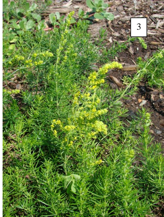
Close-up of the flower stalk

Propagation: Seed sown when ripe; by division in autumn or early spring.